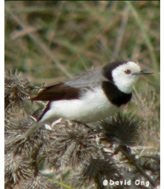
White-fronted Chat

This birding guide is one of a series prepared by the Echuca and District Branch of Bird Observation & Conservation Australia (BOCA).