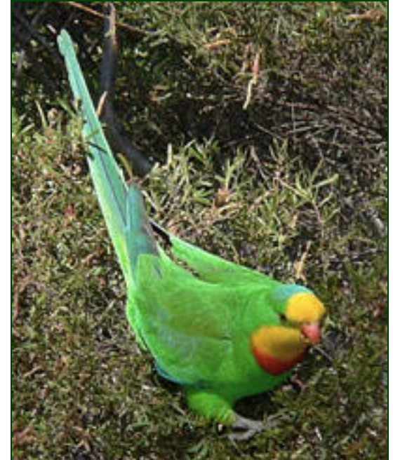
Superb Parrot

This tour of Barmah Forest, a Ramsar-listed wetland of international significance, commences at Barmah Town. It is suggested that you use this guide in conjunction with a map of Barmah Forest.