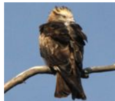
PHOTO 2.

The solution is on our web site and will be in the next issue of Plains-wanderer.